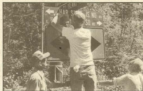
▲ Grangers post new signs.

Signs on the Island have been changed and the State is in the process of replacing the signs on the highway.