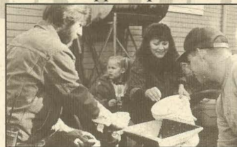
250 gallons of cider this year!