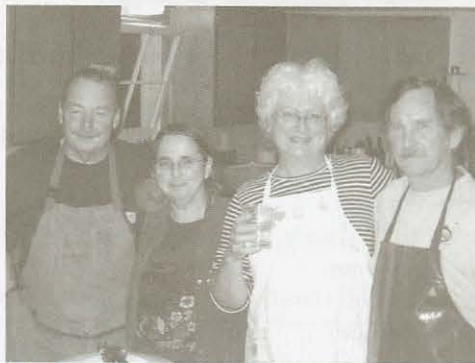
The Dues Crew!

shown in the Annual Financial Report (on page 3) membership dues represent over 21% of our overall budget.