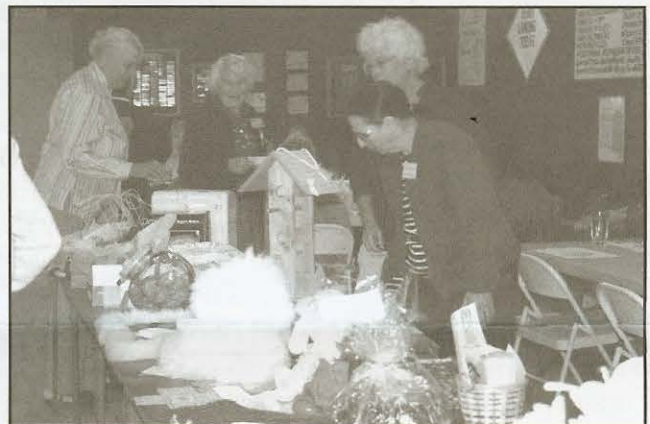
Members of the Women's club previewing the auction items at the March 2008 meeting.

Join us at Women's Club and experience the feeling of